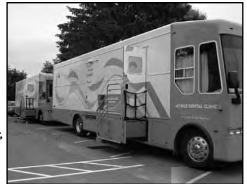
Brush.Brush.Smile!® buses participate in Elizabethtown Conference tour

On Thursday June 6, St. Joseph Health Ministries participated as a stop on the Health and Medical Services Field Trip as part of the Amish America Conference held by Elizabethtown College's Young Center. The tour was attended by scholars, health providers and visitors with broad geographic and professional experiences and highlighted model medical and dental services provided to the Plain Communities in Lancaster County. The group toured the Brush.Brush.Smile!® mobile dental units (BBS) and spoke with the dental staff about our program serving Amish and Mennonite families. The SJHM program, in collaboration with the Penn State Extension services, works with host families who serve as "dental champions" within the network of Plain families. In the summer of 2012, the BBS program visited three host sites and provided dental services to 114 Amish and Mennonite children. This summer, we are scheduled to visit at six sites, and serve over 200 children in need of dental services.